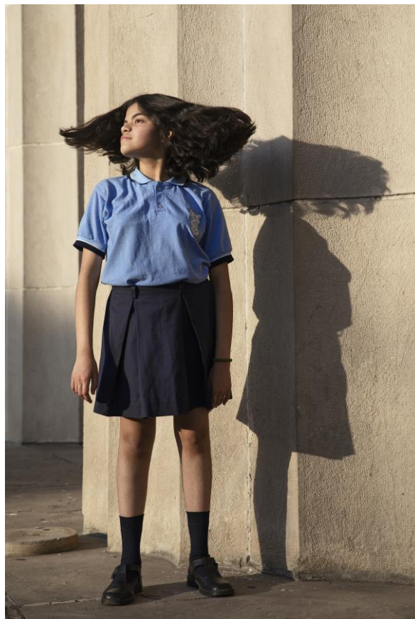
© Irina Werning, Argentina (Pulitzer Center)