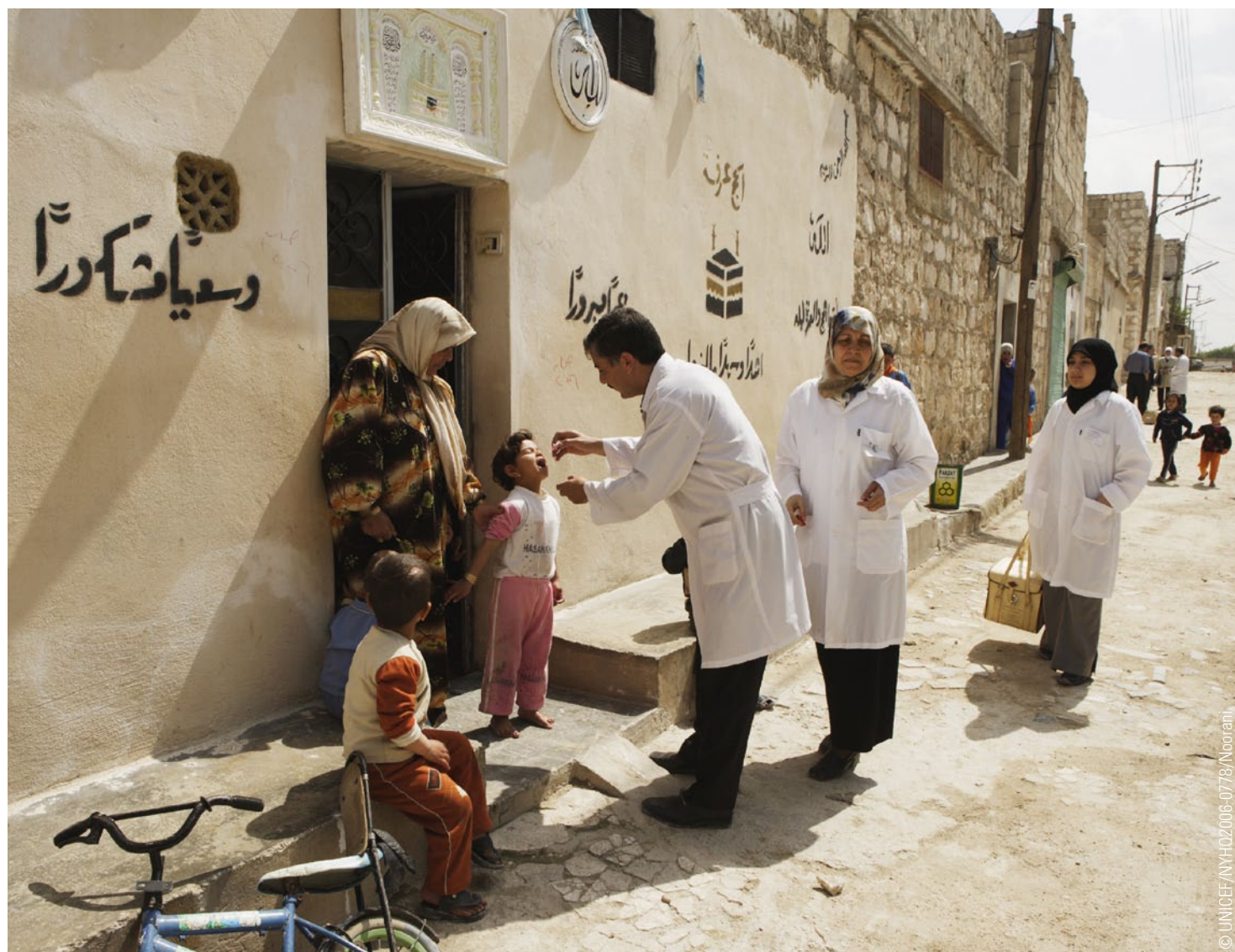
April 2006 - A child receives a dose of oral vaccine from a member of a mobile vaccination team in the Karm Al Afandi neighbourhood of the city of Aleppo. At that time, Syria had made considerable progress towards improving the situation of children and women and was on track to achieve almost all Millennium Development Goals.

Driving home the need for decisive action, the Director-General of the World Health Organization (WHO) declared on 5 May 2014 that the international spread of polio is a Public Health Emergency of International Concern 1 . This is only the second time WHO has ever issued such a declaration. The international spread of polio during what is normally the low-transmission season, including within the Middle East, is an extraordinary event that constitutes a major public health risk to other countries and requires a concerted international response.