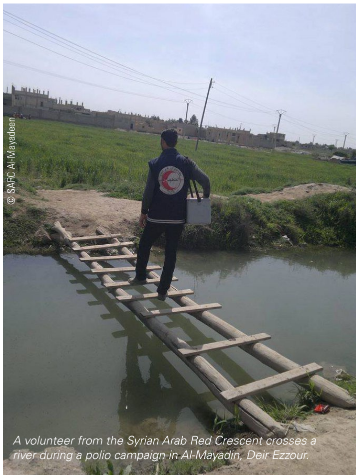
A volunteer from the Syrian Arab Red Crescent crosses a river during a polio campaign in Al-Mayadin, Deir Ezzour.

Inside Syria, despite heavy fighting in many areas and challenges of access, seven vaccination rounds took place between December 2013 and June 2014 through close cooperation with local partners and volunteers. They were held in schools and health centres, on public buses and at the doorsteps of Syrian homes.