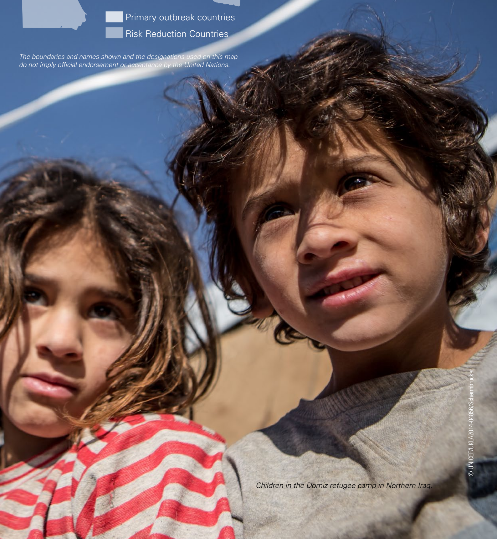
Children in the Domiz refugee camp in Northern Iraq.

The boundaries and names shown and the designations used on this map do not imply official endorsement or acceptance by the United Nations.