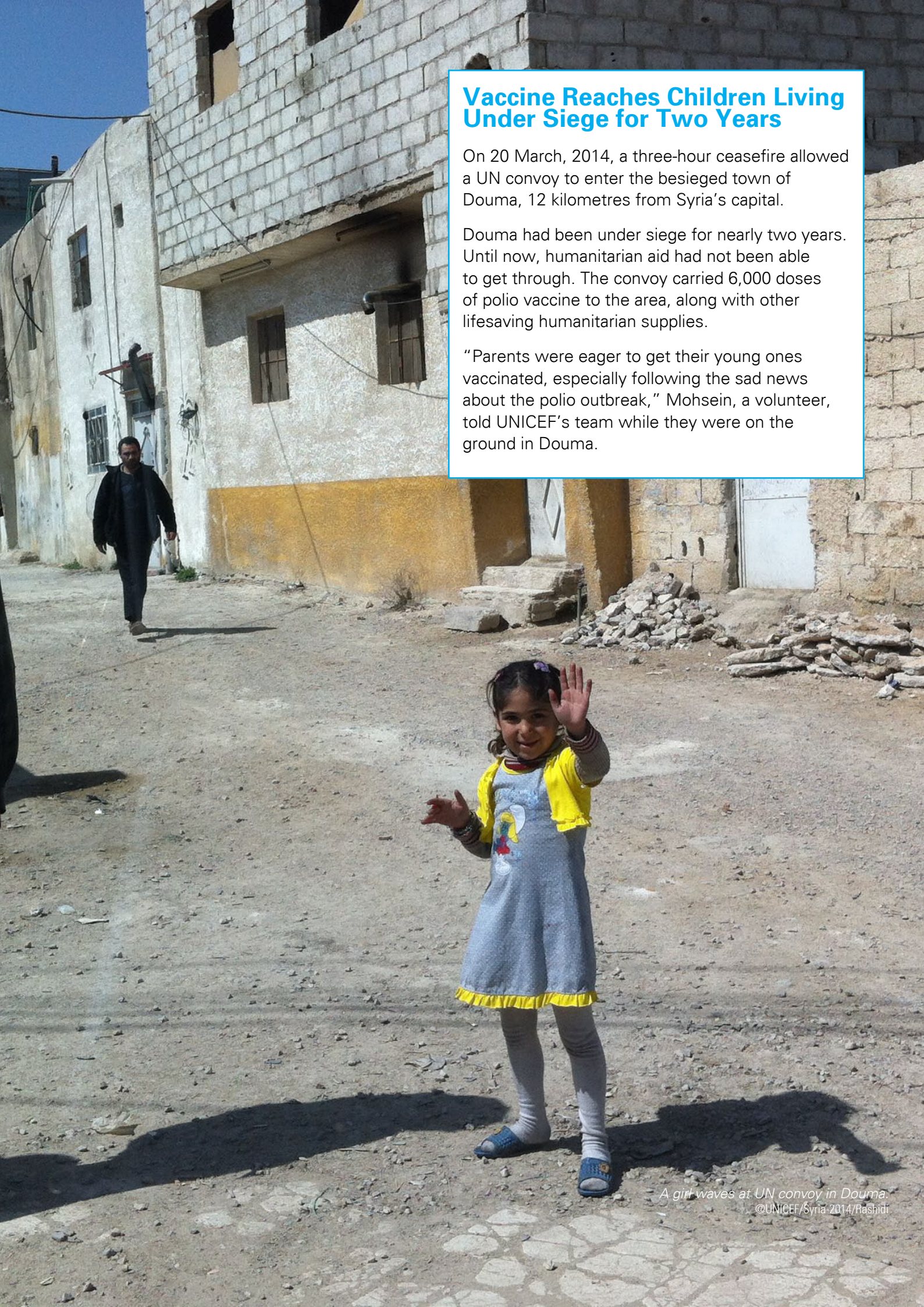
A girl waves at UN convoy in Douma.